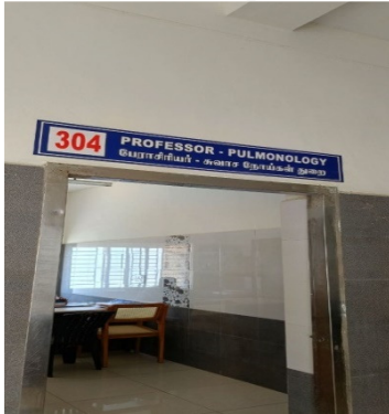
Professor Room Pulmonology