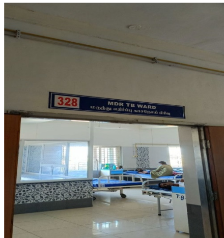
MDR TB Ward