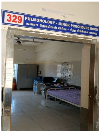
Pulmonology Minor Procedure