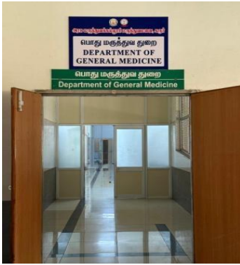
DEPARTMENT OF GENERAL MEDICINE