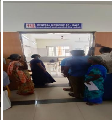
GENERAL MEDICINE – OP (MALE & FEMALE)