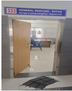
OFFICE OF THE DEPARTMENT