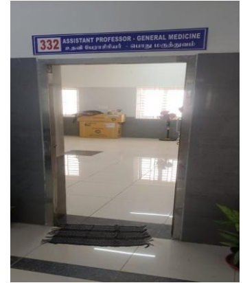
ASSISTANT PROFESSOR ROOM